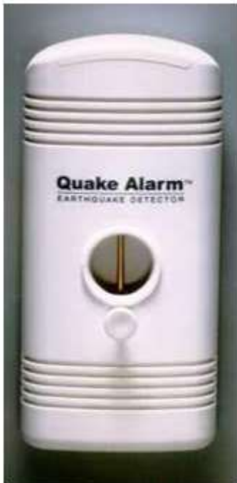
6" high x 3" wide x 1-1/4" deep